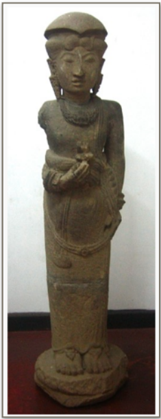
Fig. 4: Panji sculpture II.

Another part of visual art is the Panji sculpture, from Candi Selokelir. Today, this sculpture is kept in the University Library of the Fine Arts of the Institute of Technology in Bandung, Indonesia. The statue (fig. 4) originates from the middle of the 15th century (2013:316). The archaeologist Stutterheim initially found the body in 1936 and a few months later the missing head of the sculpture was discovered. The statue was then completed. The head is equipped with the cap and hence it was identified as Panji (Stutterheim 1936). However, the original location of the sculpture within the temple is unknown. The three-dimensional Panji sculpture is described by Kieven (2013:319) in detail as follows: