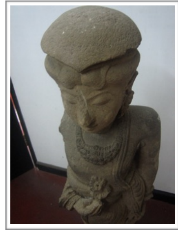
Fig. 1: Panji sculpture I.

In this introduction I will provide a brief description of the figure Panji. 8 He is a legendary prince and the main character of one of the famous Javanese myths, the so-called Panji stories which originated in the East Javanese period. The Panji stories “relate the adventures of Prince Panji in regaining his betrothed, Princess Candrakirana” (Kieven 2013:27). Prince Panji, from the kingdom Jenggala/Kuripan, is also known as Inao or Inu Kartapati. The complete title of Panji is Raden Panji. Raden stands for a person of superior status, female or male. ‘Panji’ is in Old Javanese language used as the title of an aristocrat. In modern Javanese language it is translated as ‘banner’ (Kieven 2013:27).