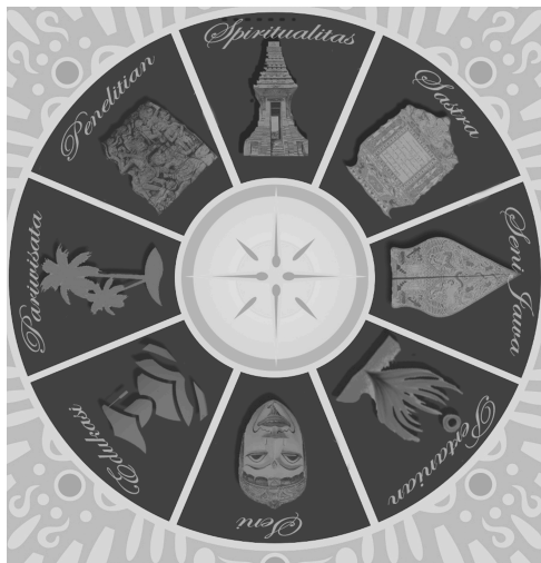
Fig. 10 Aims of Pusat Pencinta Panji