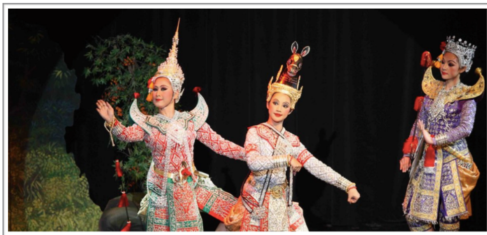
Fig. 6: Lakon Nai Dance Drama (Thailand).

A scene taken from the performance "Inao Exiting the Cave". This episode takes place after Inao (left) and Bussaba have fallen in love and eloped. They are hiding in a cave, but Inao needs to leave her there to go face the problems they have caused. Inao, accompanied by his retinues, rides a horse to the Kingdom of Daha to go explain his actions to the King. Source: http://www.seameo-spafa.org/multimedia_detail.php?tid=434&c=3 (last accessed June 30, 2015).