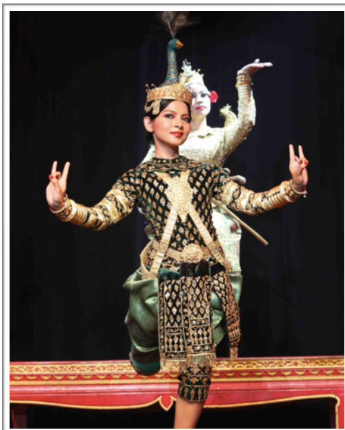
Fig. 9: Khmer Classical Dance - Yarann Chasing a Peacock (Cambodia).