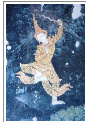
Fig. 5: Mural painting in Wat Somanat, Bangkok depicting Inao dancing with his kris.

Puaksom (2007:56) provides the illustration (fig. 5) of a mural painting in a Buddhist temple in Bangkok depicting Inao. It shows Inao dancing with his kris. Inao is dressed in a court ceremonial costume with exotic Javanese elements and a decorative hanging cloth. His costume is embroidered in gold, his bracelet embellished with a ruby, his finger is decorated with a gold diamond ring. Furthermore his head is covered with a bejeweled crown with ear-shape ornaments (Puaksom 2007:55).