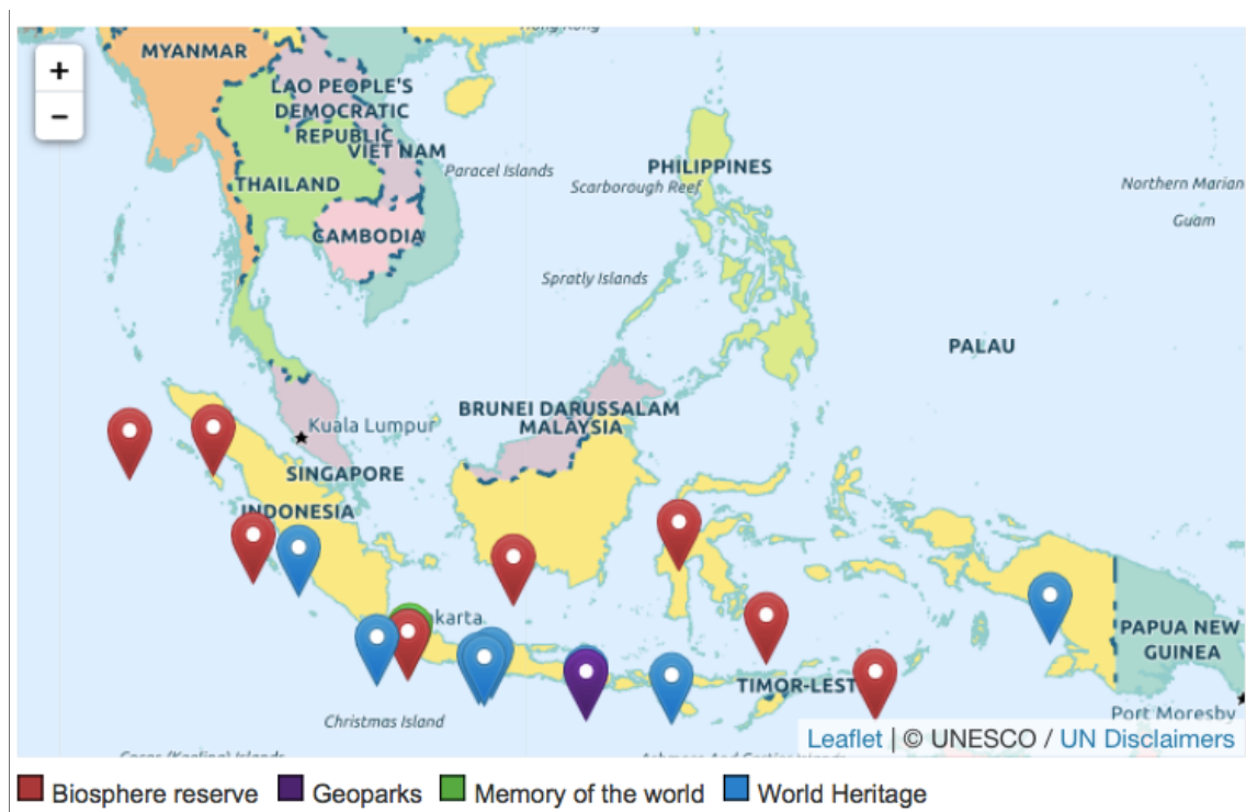
Table 2.1 Map of the Indonesian archipelago.

Indonesia, as the largest archipelago in the world, comprises more than 17,000 islands and is the fourth most populated country of the world. “...with more than 240 million people from over 500 ethnic groups, who speak 700 local languages, Indonesia was born a multicultural nation and carries the national motto ‘Bhinneka Tunggal Ika’ which means ‘Unity in Diversity’” (The Ministry of Education and Culture, Republic of Indonesia 2012:9). In comparison, the population of Russia as the world’s largest country by landmass, has only 142 million people. 14