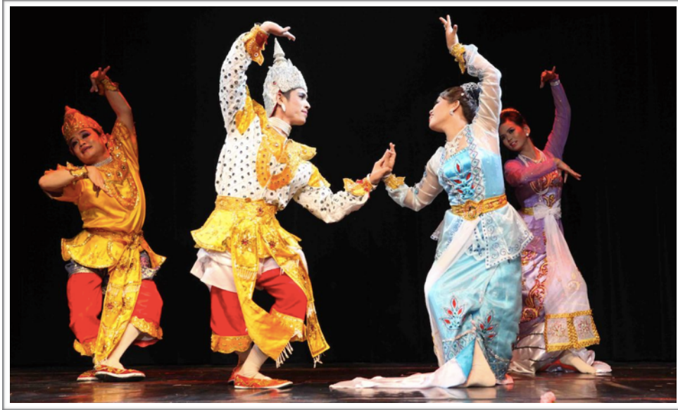
Fig. 7: E-Naung Dance Drama - E-Naung Zattaw (Myanmar) Drama.