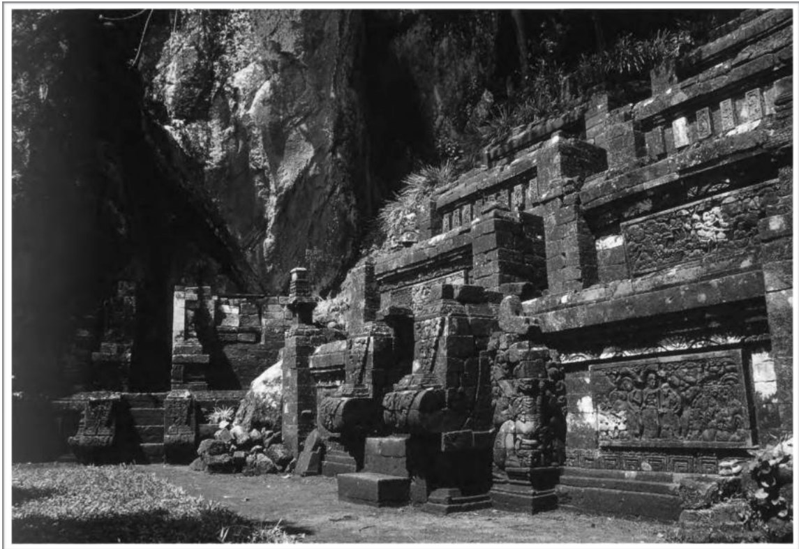
Fig 2: Candi Kendalisodo.