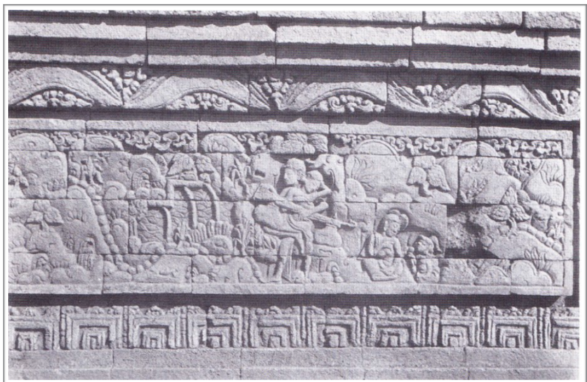
Fig 3: Temple relief at Candi Kendalisodo.