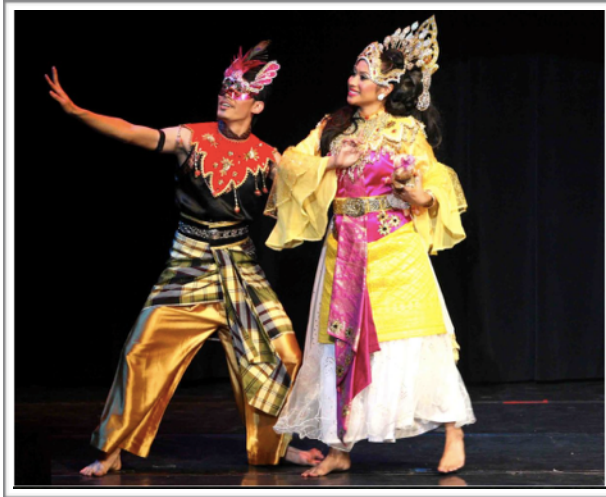
Fig. 8: The Journey of Kirana - Hijarah Kirana (Malaysia).

This episode tells the story of Galoh Cendera Kirana and Raden Inu Kertapati, who are in love and engaged to be married, arousing the jealousy of Galoh Ajeng. Galoh Cendera Kirana receives a golden doll from her beloved Inu Kertapati to help her overcome her loneliness. The jealous Galoh Ajeng demands to have Raden Cendera Kirana's doll as well as bird that they both want. After the bird escapes, Galoh Ajeng complains to the ruler, Paduka Liku, who demands that Galoh Cendera Kirana surrender her doll and the bird. Galoh Cendera Kirana refuses and is ordered to cut her hair off.